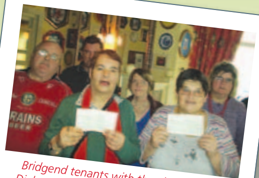
Bridgend tenants with the cheques for Diabetes UK and Cancer Research Wales

At the last Focus Group meeting it was decided that the two nominated charities for the forthcoming year will be Alzheimers Society and The Red Cross.